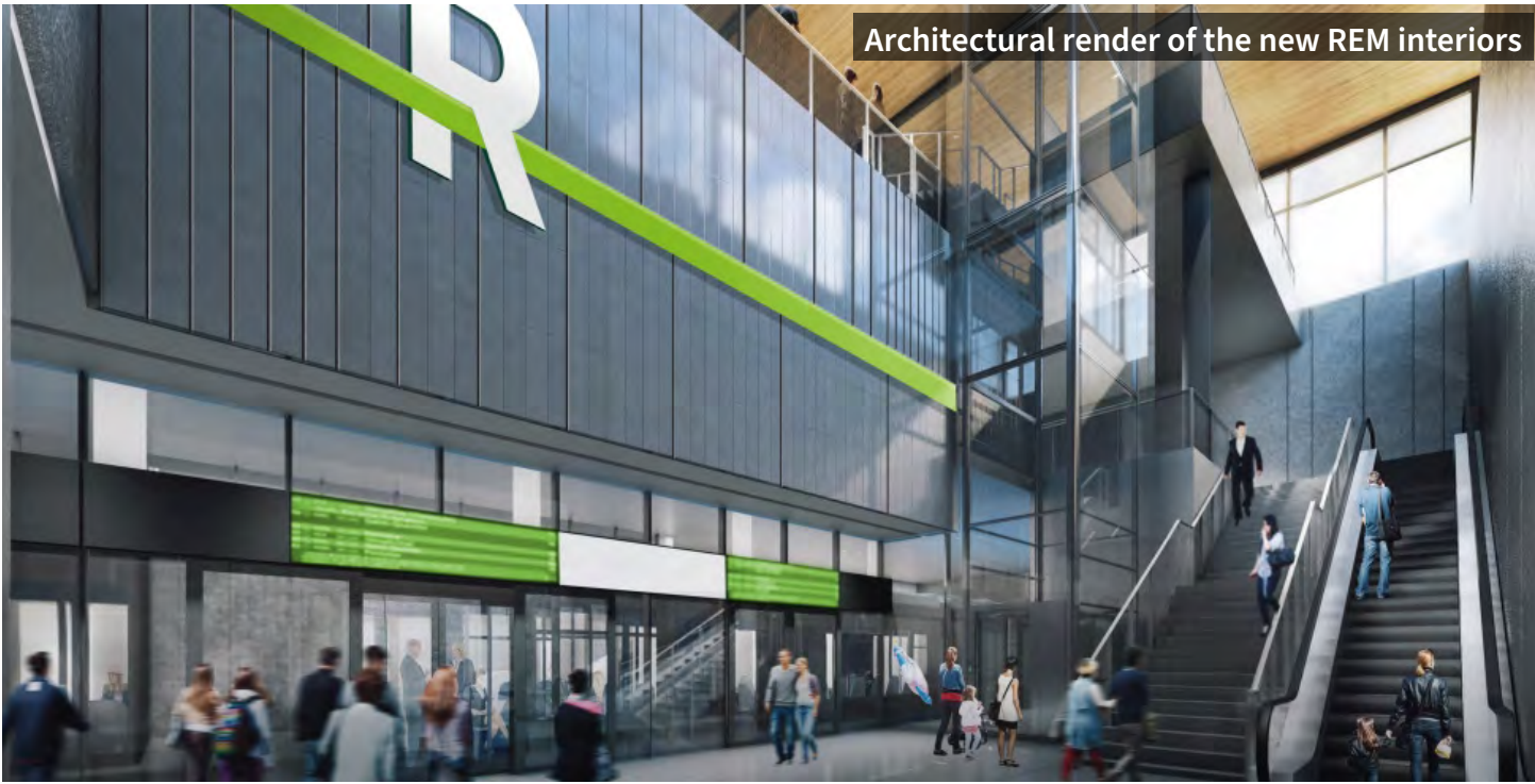
1 REM_Station_intérieur.