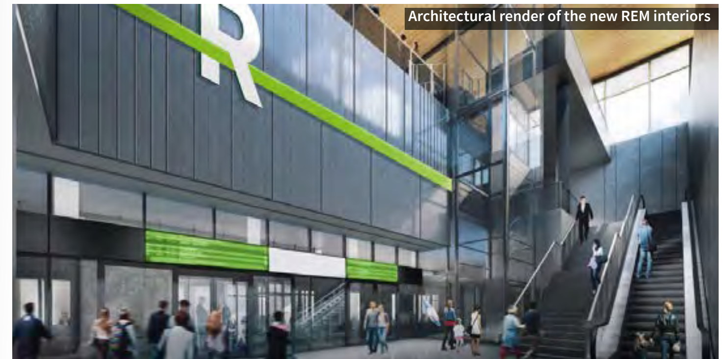
Architectural render of the new REM interiors